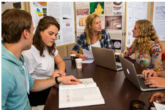
Students discuss in working groups

The financial risks associated with a lower intake, or an unexpectedly high dropout rate during the degree programme, will be borne by the University of Groningen, provided