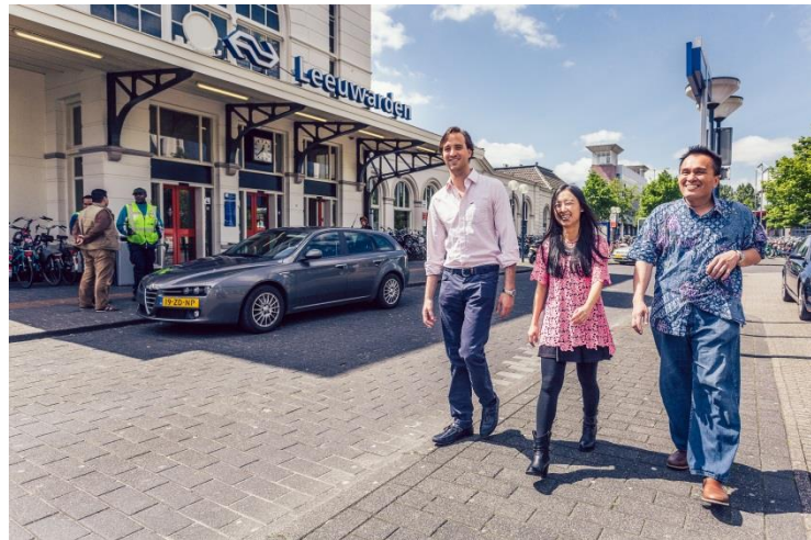
UCF masterstudents Environmental and Energy Management (UT)

In addition, with the support of UCF-1 funds and in partnership with Philips Drachten and the University of Twente, the University of Groningen is launching a small-scale pilot for an Honours Master's (an additional programme on top of a regular Master's) in High-tech Systems and Materials. Issues being explored are how this Honours Master's can be further expanded in terms of themes, student numbers and the companies involved in the partnership (field labs). There appear to be ample opportunities to develop a fully fledged Master's degree programme in this area, in line with the Knowledge Agenda's 'high-tech manufacturing' research priority and the HTSM-Noord project 'Region of smart factories'.