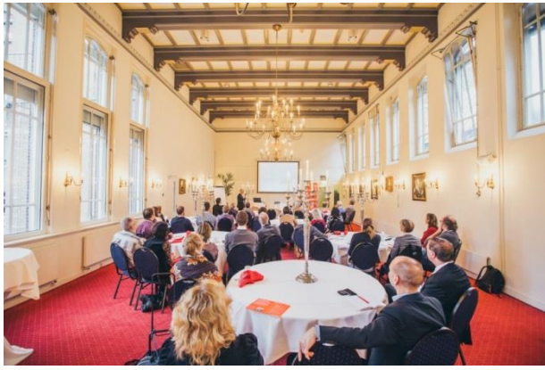
Opening Autumn School

Fryslân will continue these activities in the Graduate School, presenting itself through the overarching theme of 'Future challenges and solutions'.