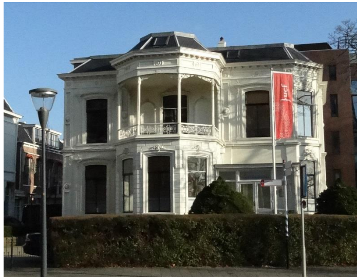
Current headquarters UCF and RUG/Campus Fryslân

The Faculty will be housed at a location in Leeuwarden city centre. The choice of location and further decision-making about accommodation will take place at the end of 2015. The municipality of Leeuwarden has expressed a willingness, where possible, to facilitate the accommodation of the Faculty, where this will also benefit the attractiveness of the city centre.